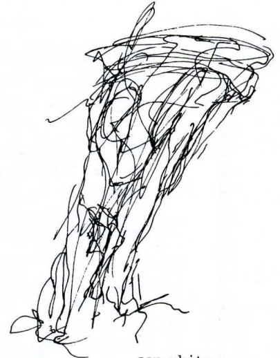
ean white- self-portrait

subject of such fascination and controversy? What is it about these beasts that excites children? Why have scientists dedicated their lives to the study of them?