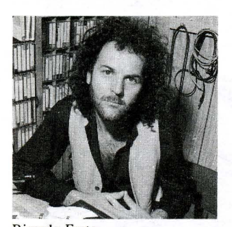
Ricardo Frota photo Adina Sabghir

laser printer for Macintosh photocopy machine (you know, xerox) 8 or more channel light board theatrical lighting instruments in good working order air conditioner donated printing graphic design